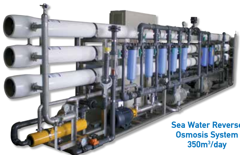
Sea Water Reverse Osmosis System 350m 3 /day