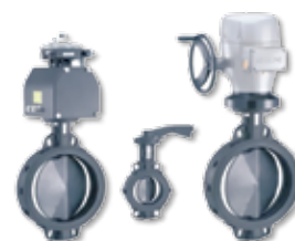
Valves with Pneumatic & Manual Motors