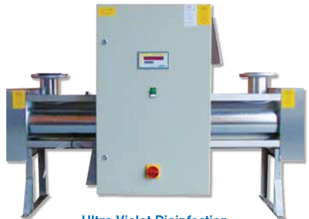
Ultra Violet Disinfection