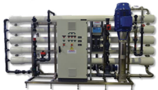
Brackish Water Reverse Osmosis System 700m 3 /day