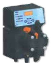
Metering Controllers & Dosing Pumps