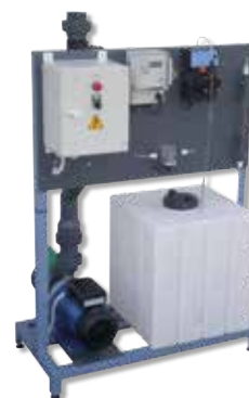
Automatic Chlorination System

TEMAK offers total water disinfection solutions from automatic chlorination systems to ultraviolet (UV) radiation devices. TEMAK's automatic chlorination systems ensure the complete disinfection of water supply network, potable water tanks and swimming pools, through controlled chlorine dosing but also continuous water quality control before water is led to consumption. The ultraviolet radiation devices are used for water disinfection through the inactivation/destruction of present pathogens, to inhibit their growth during distribution of water to the final consumer.