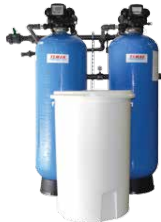
Twin Softening System

A complete range of automatic softeners is available for any water supply.