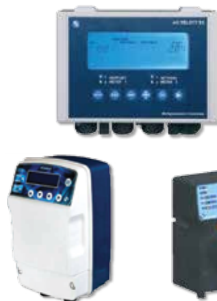
Metering Controllers & Dosing Pumps

TEMAK provides water treatment solutions for swimming pools, such as pH, chlorine, dosing pumps and exchangers . The exchangers cover a wide range of applications and are used to heat or cool liquids, using water, steam or other liquid that circulates inside the tubes.